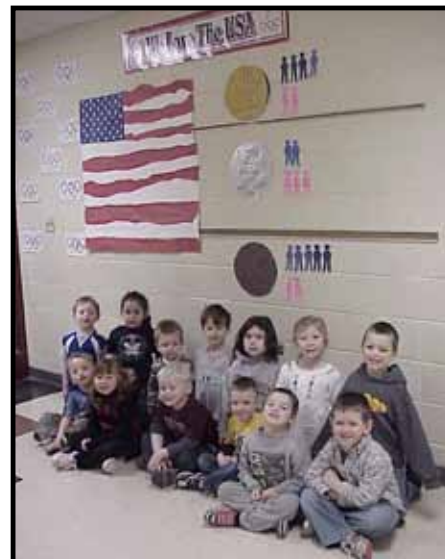
4K with their Olympic bulletin board

Some upcoming events in 4K include: a tour of the Cassville Fire Station, a Dr. Seuss' birthday celebration, and preparation for St. Patrick's Day.