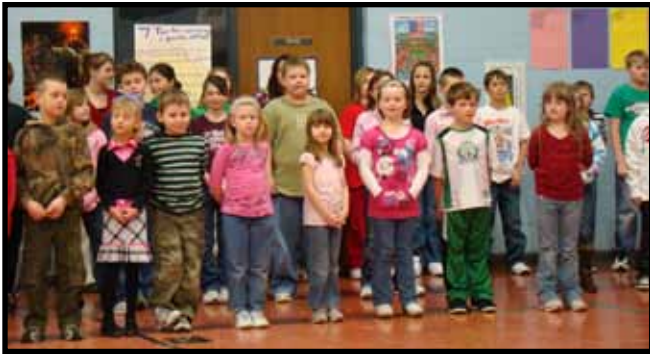
Elementary Students performed...

The time capsule that was made and placed into the elementary school wall in February 1990, was opened and the contents displayed in the Media Center. The 1990 items were available for viewing by the public along with the new items that will go into the capsule and placed back into the wall of the school. These new items will help students 20 years from now to have a better understanding of how school life is today. After the assembly, the students enjoyed the rest of the morning participating in the school carnival.