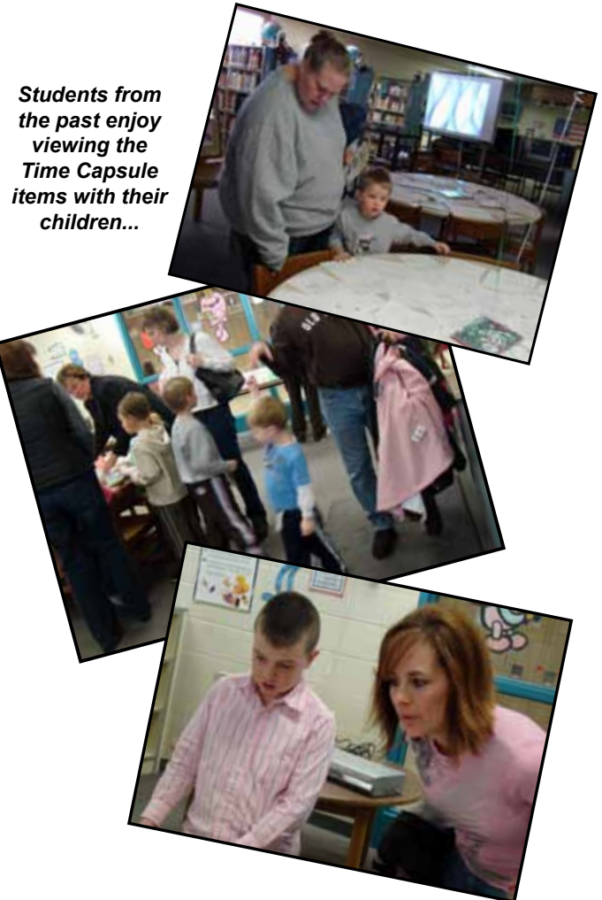
Students from the past enjoy viewing the Time Capsule items with their children...