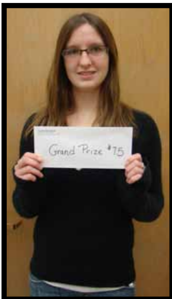
$75 Grand Prize Winner