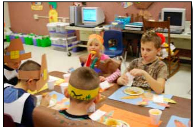
Feasting on corn muffins, popcorn, cranberries, & pumpkin pie has become a favorite tradition of the students.