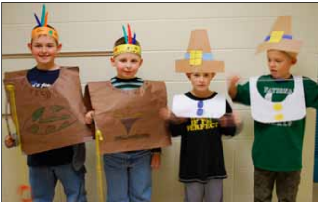
Native Americans and Pilgrims prepare their authentic games of "Ring on a Stick" and the "Button Game."