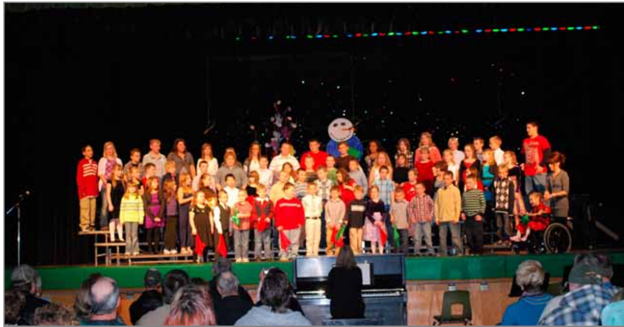
Grades 1 - 6