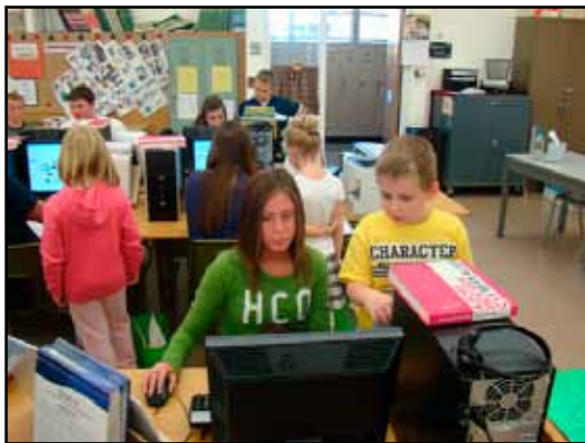
Business Ed. Students working with 2nd Grade...