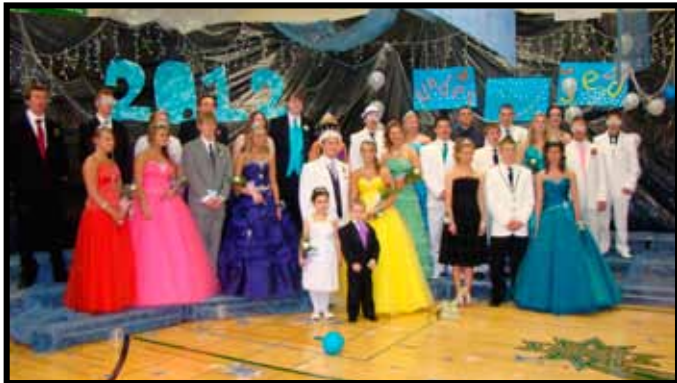
Class of 2012

Prom was held on Saturday, April 30, 2011 from 8:00 p.m. to 12 Midnight. The 2011 Prom Theme was "Under the Sea".