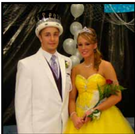
2011 Prom King and Queen