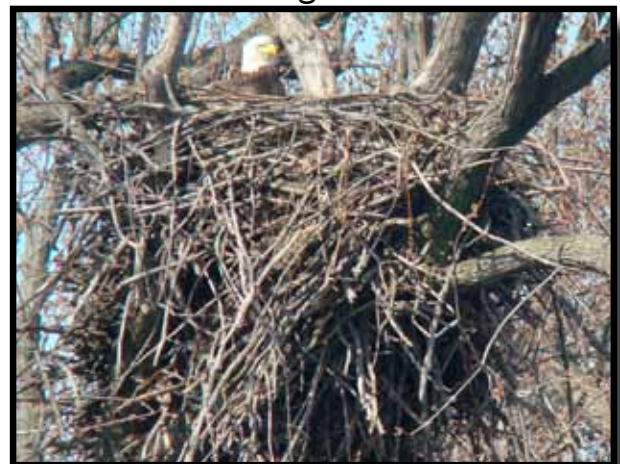
A Blue Herron Nest on the Mississippi River