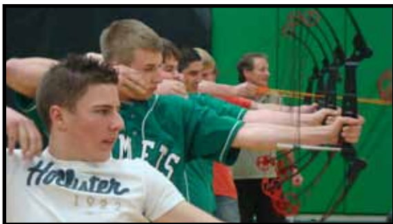
Students take aim as they prepare to shoot the target